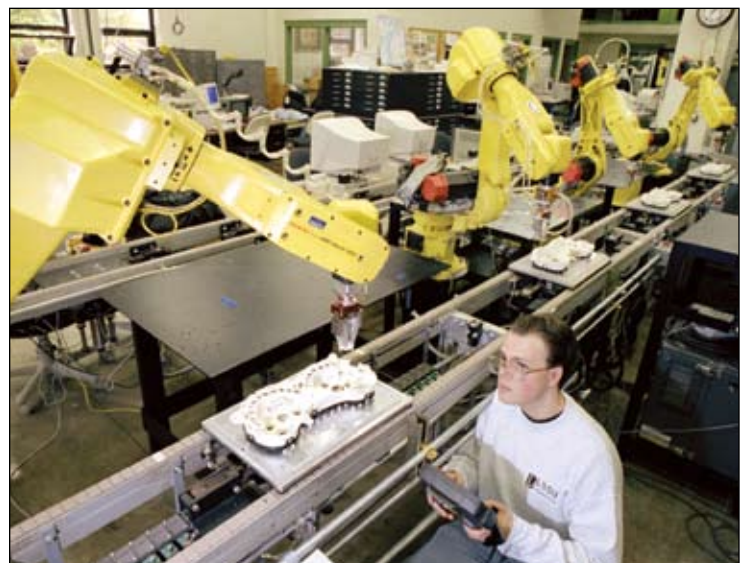
A series of workstations dubbed "the oval line" features an integrated Fanuc robotics system.