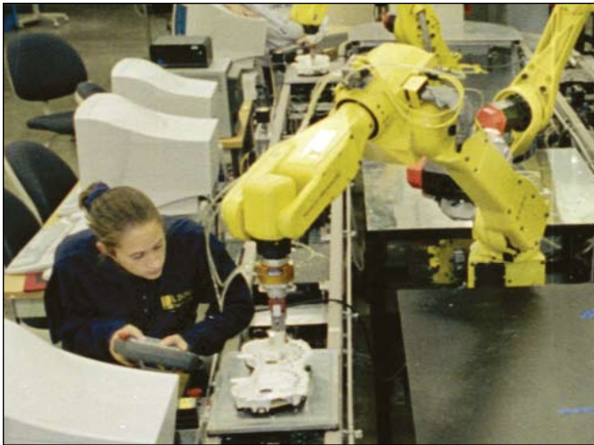
Karel software is used to program a family of Fanuc Arcmate robots.

Students begin working extensively with the robots at the junior level. However, there are earlier opportunities for those students who have a personal desire to learn and work with the robotics equipment.