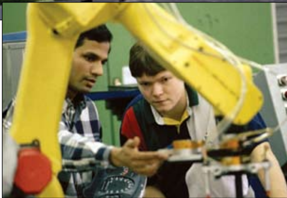
Courses are taught by faculty who view teaching as a priority.

You may choose to specialize in robotics while completing your bachelor's degree at LSSU in one of the following fields: