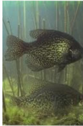
Spawning Blackchin Shiner (Pomoxis nigromaculatus) in a shallow, weedy area.