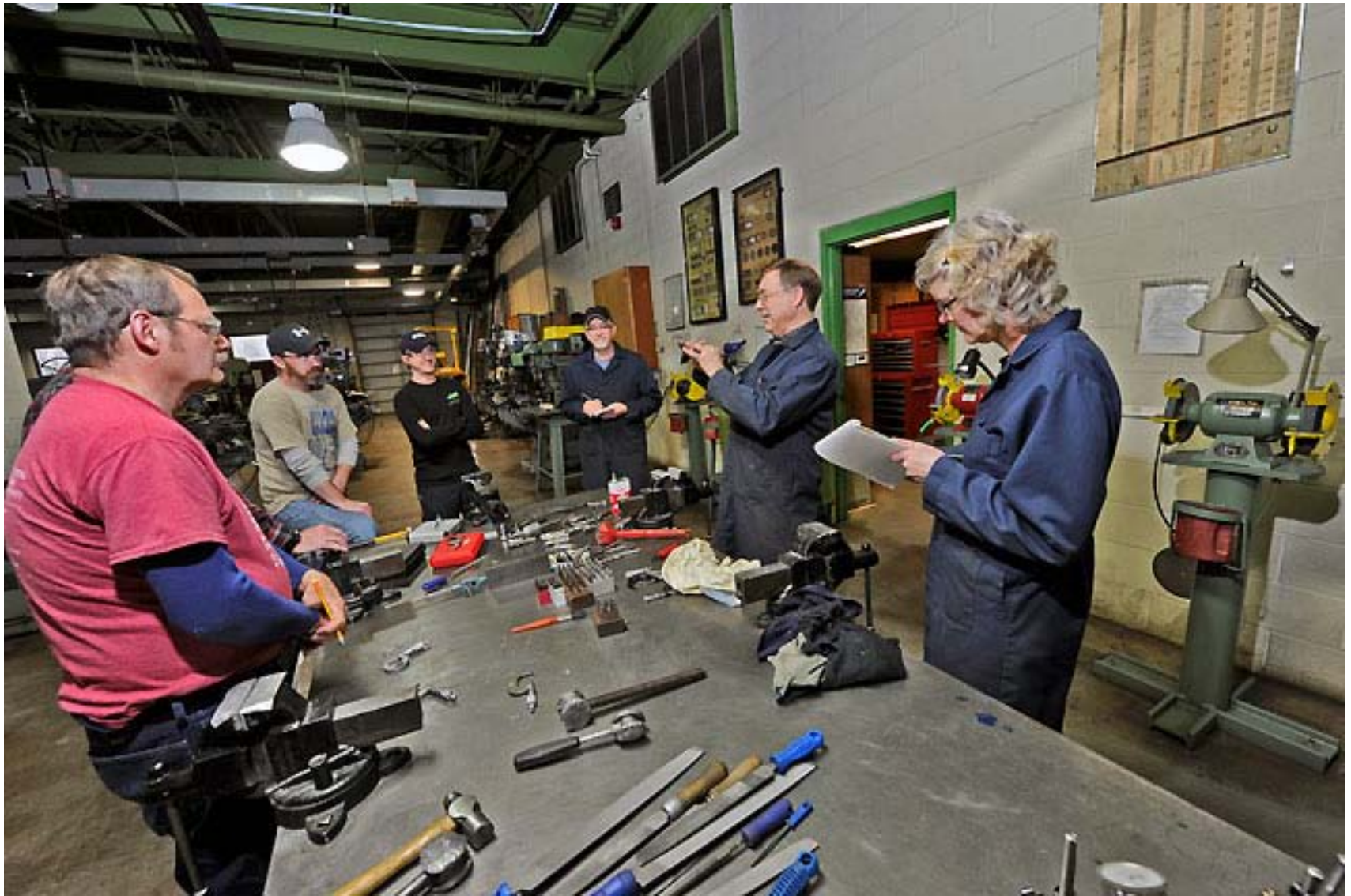
University teams up with Michigan Works! for workforce retraining