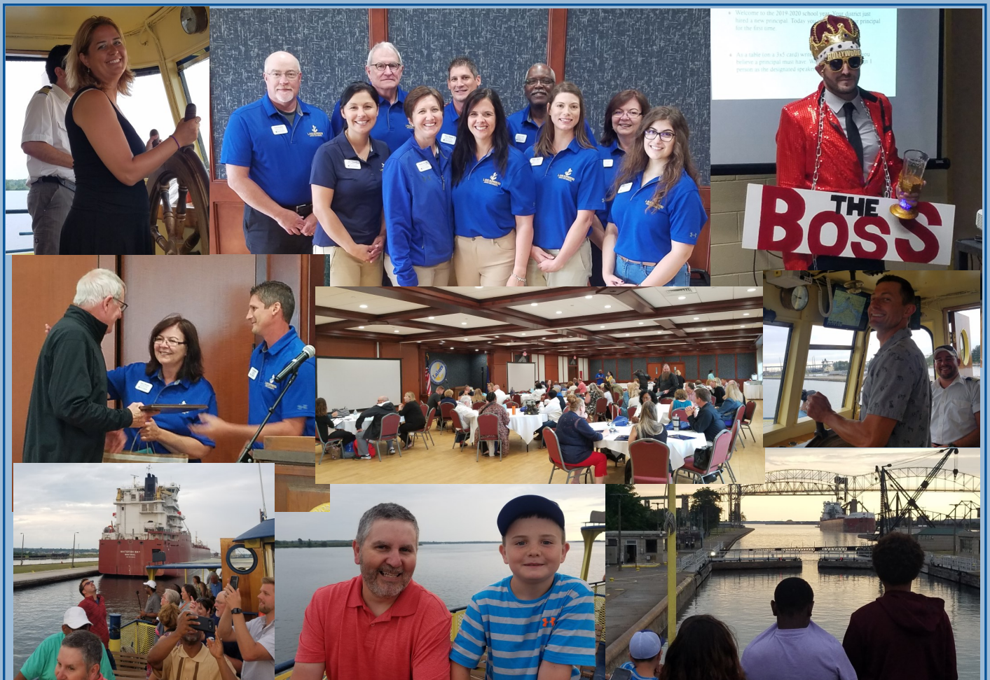
2019 Summer Retreat Footage