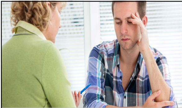
After a Report or Complaint of Title IX Sexual Harassment