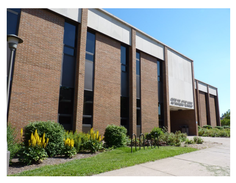
Utility System Infrastructure : Building is in generally fair condition.