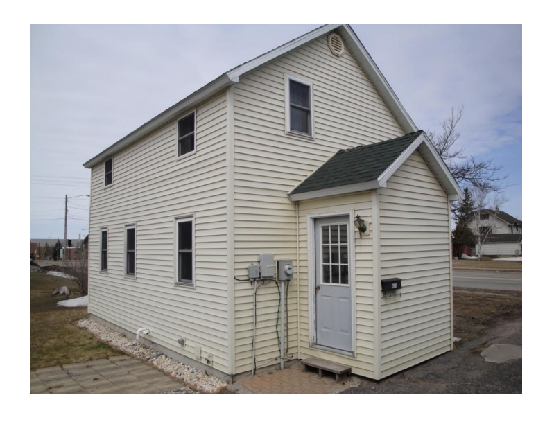
Utility System Infrastructure: House was purchased in 2018.