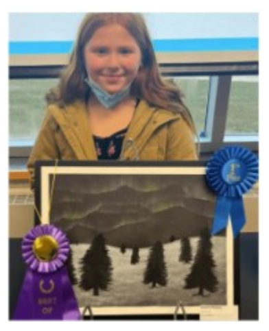
One of our students was awarded "Best of Show" out of 11 schools 3rd thru 8th grade!

Film Festival Experience at our School by Saugatuck Arts Council