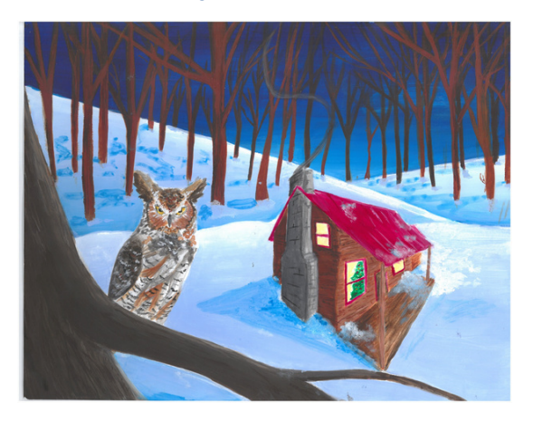
Winner 9th-12th- Dana Bacon , 12th grade, Grand Traverse Academy