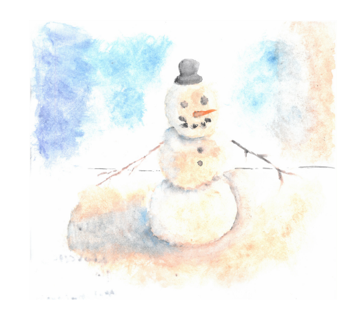
Honorable Mention 9th-12th- Liv Lovelace , 9th grade, North Central Academy