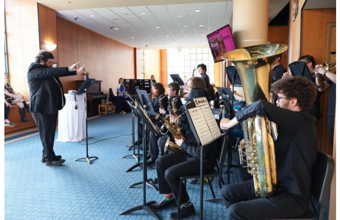
Arts Center 21 st Birthday Party!