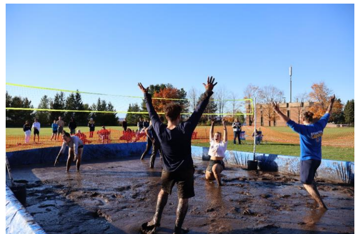
Oozeball tournament at the Tailgate