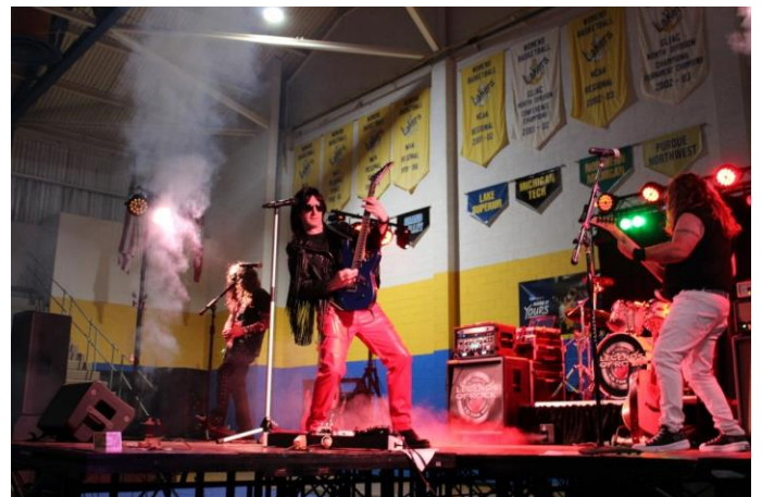
Rock the Rink post game concert in the Bud Cooper Gym