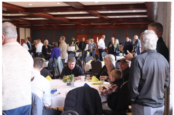
A SOLD OUT crowd (over 200) visit before the Alumni Awards and Hall of Fame Induction Ceremony.