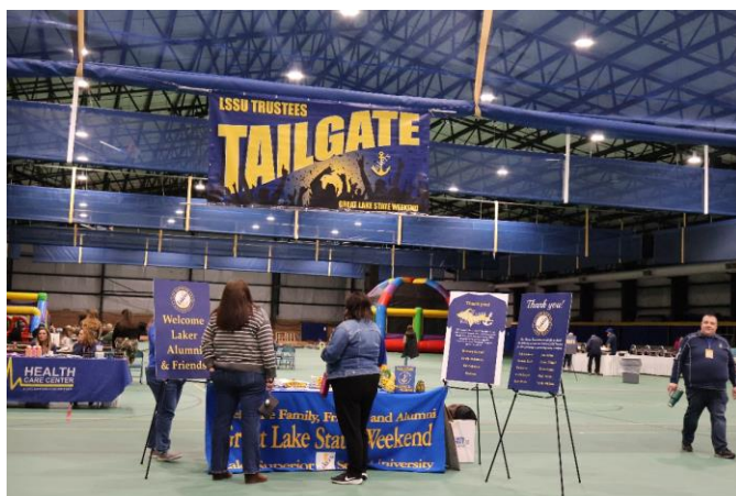
Board of Trustees Pre-Game Tailgate!