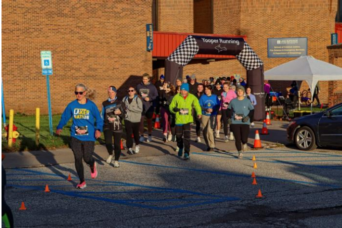
5K Fun Run