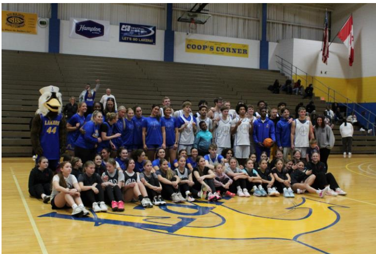
Bedlam in the Cooper