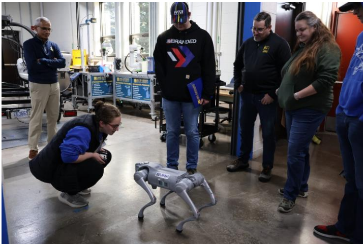
Engineering & Robotics Open House