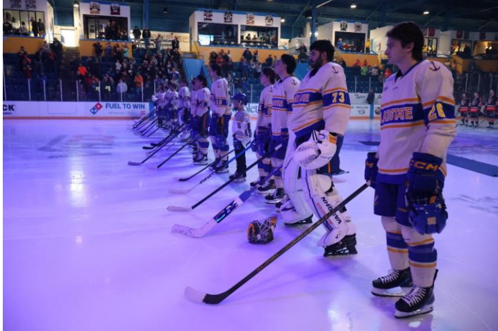
Laker hockey vs. Bowling Green